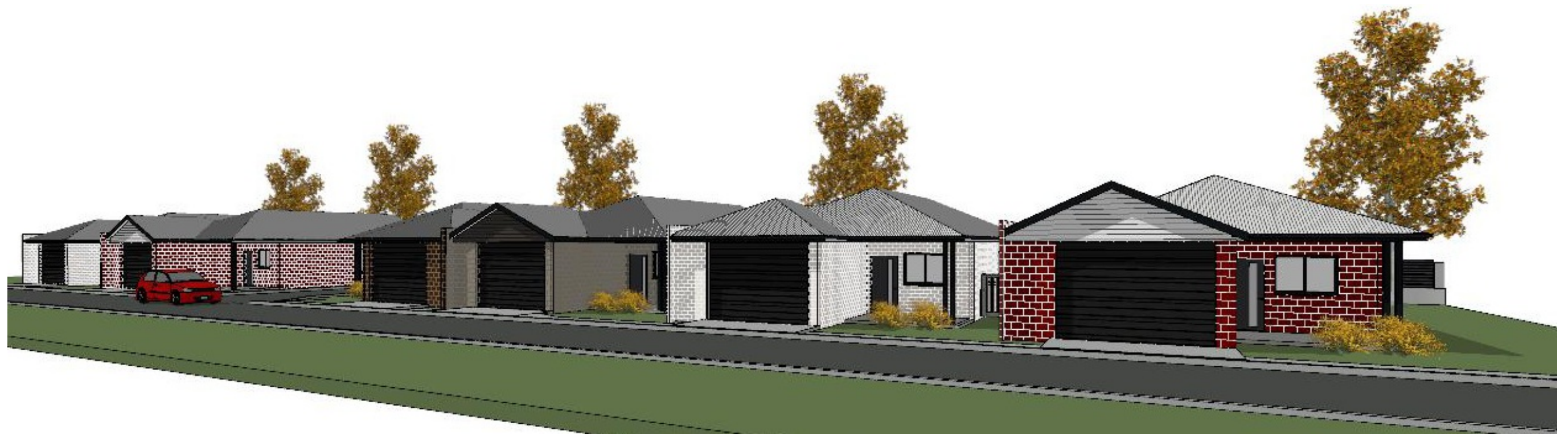
Artist's Impression only - Front elevations of Units 1 - 6