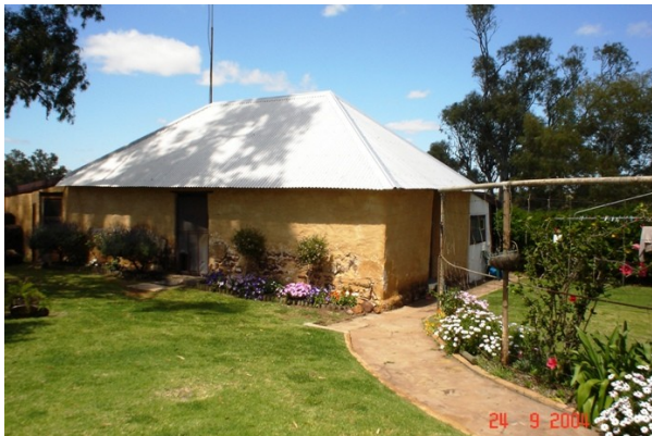
Office fmr kitchen, northwest aspect.