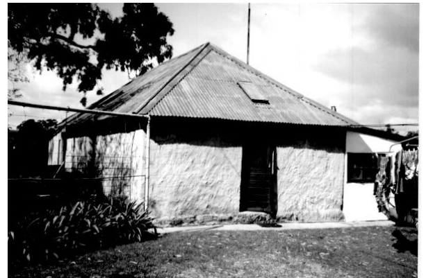
Office fmr kitchen, west side.