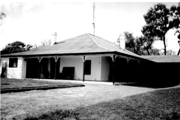
Irwin House, west side