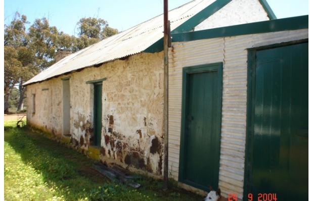
Former post office, Irwin House south facade.