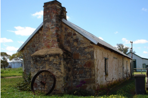
Former post office, Irwin House southwest aspect.