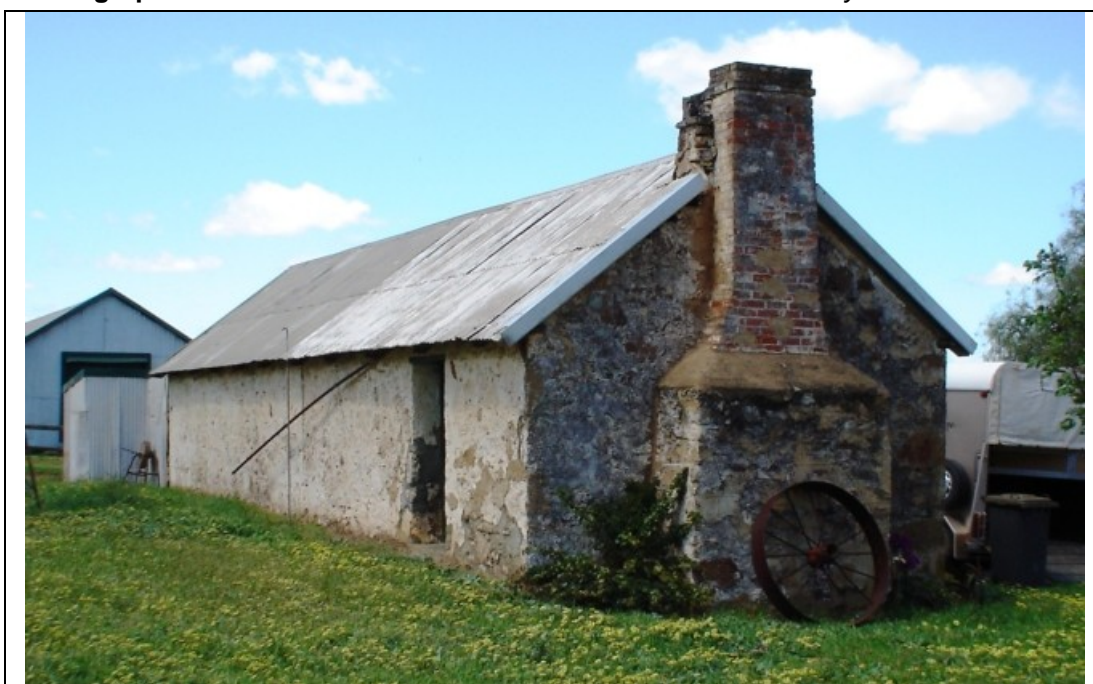
Former post office, Irwin House northwest aspect.