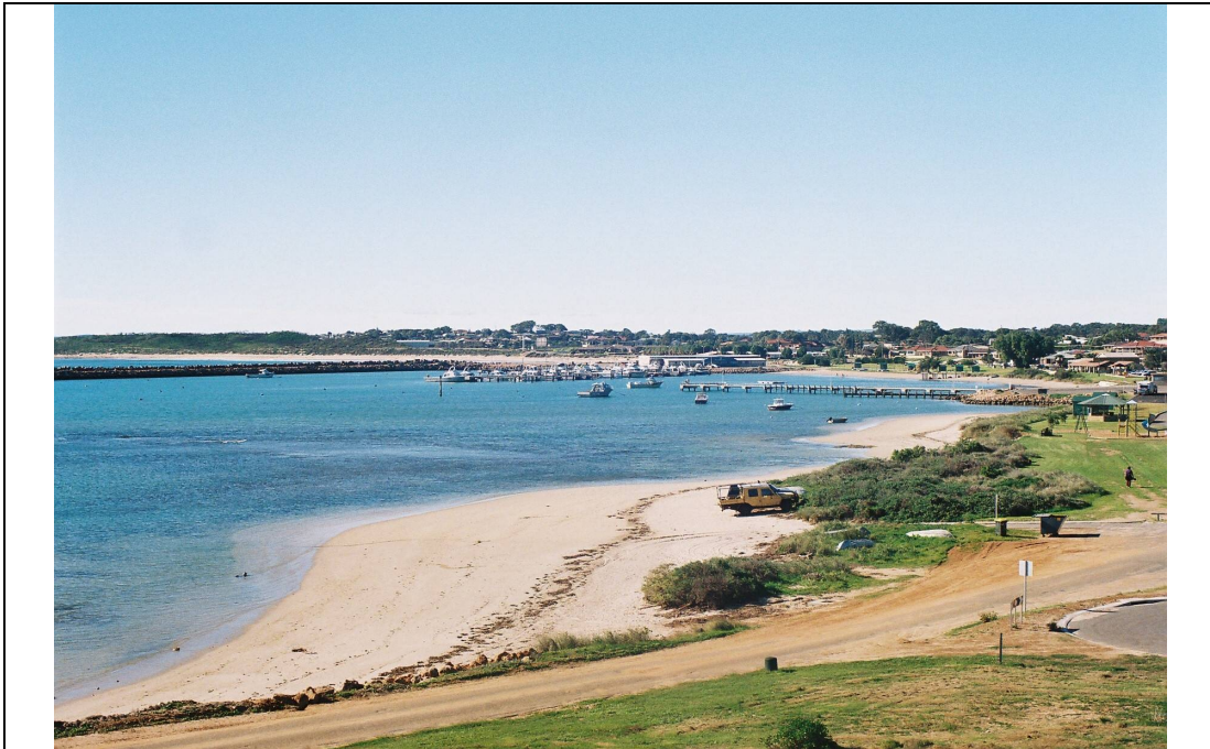
Arurine Bay from the Obelisk lookout.

Date of Photograph: 12/07/2004