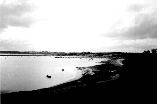
Bay looking north.