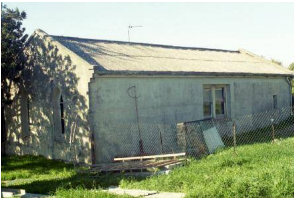
Former chapel, west and south facades.