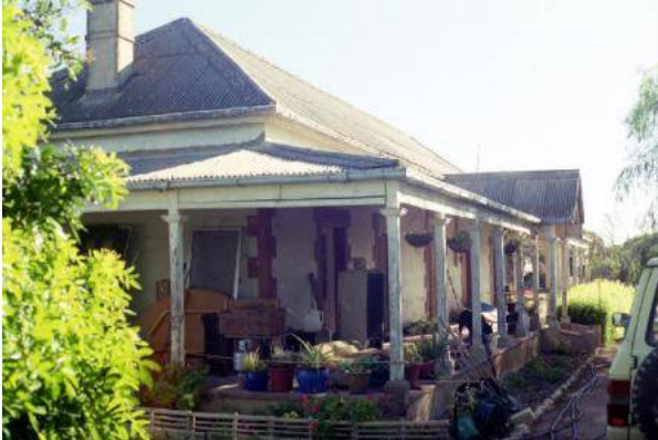
North and west aspects.