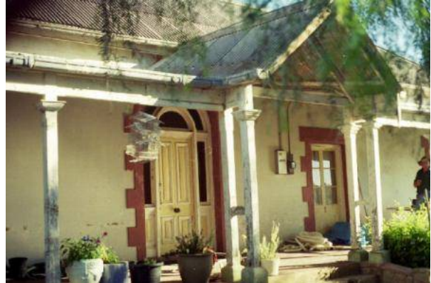
Front (north) entrance.