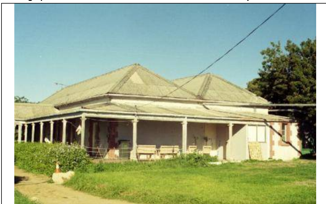
North and west elevations

Date of Photograph: 22/07/2004