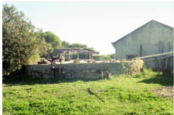
Underground tank and east side of the former chapel.