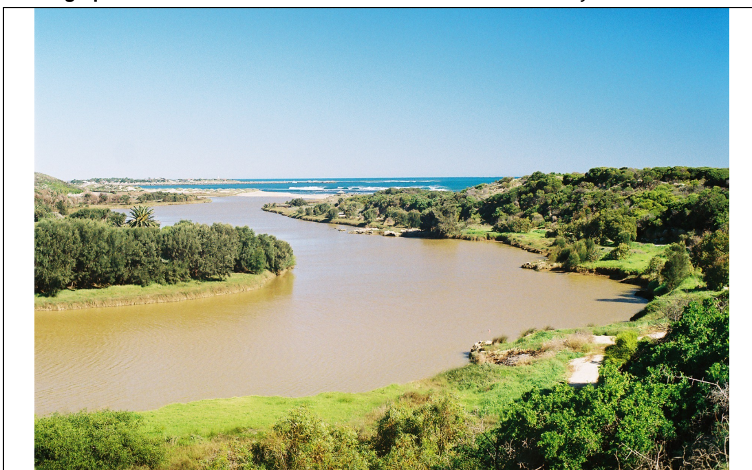
View looking west

Date of Photograph: 12/07/2004