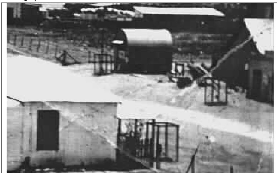
Moreton Terrace looking NW (1907), Blacksmith's shop office on right, Moreton Bay Fig cages along street.

Date of Photograph