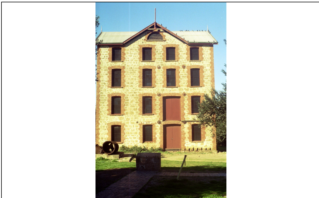
West façade from Waldeck Street