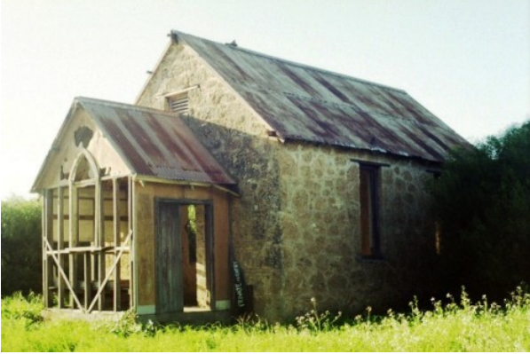
South and west elevations of church