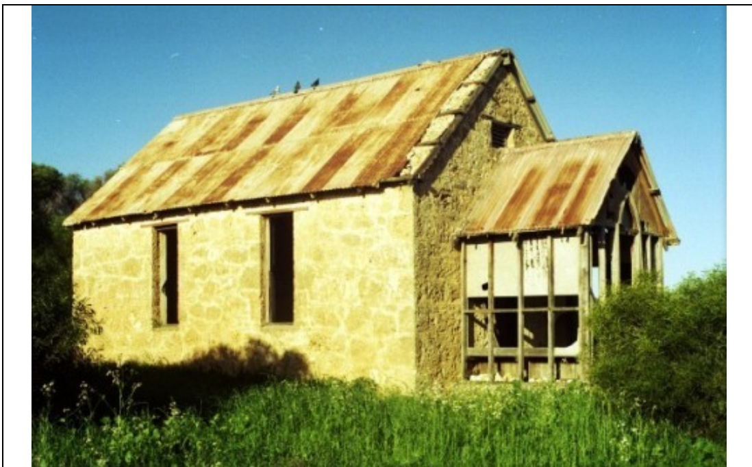
North elevation of church